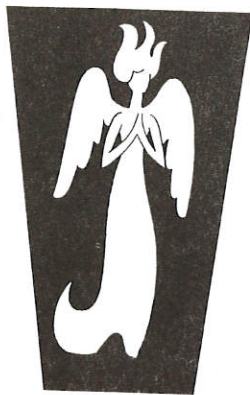
Angel, symbol and instrument of Divine Will.