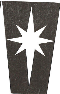
Star, symbol of Epiphany, the coming of the Wise Men.