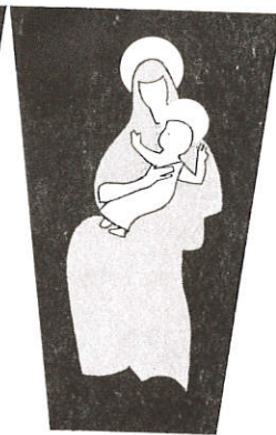
Madonna and Child, representative of the Virgin Mary and the Christ Child.