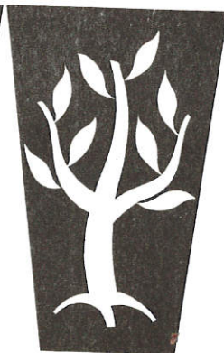
Tree of Life, symbol of the life cycle in its pattern of promise, fulfillment and rebirth.