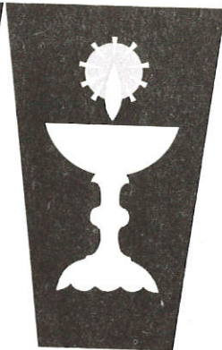
Flaming Chalice, symbol of knowledge and spiritual illumination.