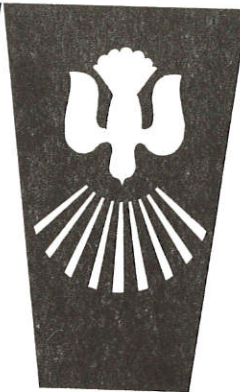
Dove, symbol of peace, the Holy Spirit and the human soul.