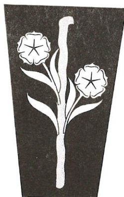
Rod of Jesse, derived from the words of Isaiah, symbol of the lineage of Christ.