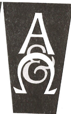
Alpha and Omega, symbol of the One in whom creation begins and ends.