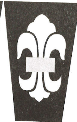
Fleur-de-lis, medieval heraldic flower derived from the lily, symbol of purity.