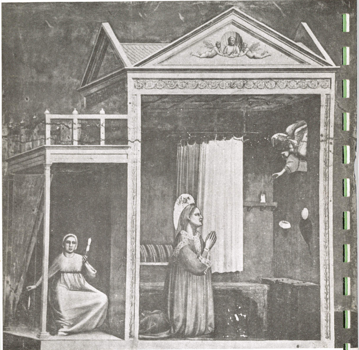
GIOTTO The Annunciation