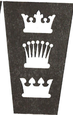
Crowns, symbols of honor and sovereignty representing the three Wise Men.