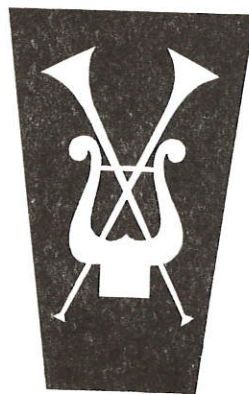
Musical Instruments, the Lyre a symbol of concord, the Trumpet of festive celebration.