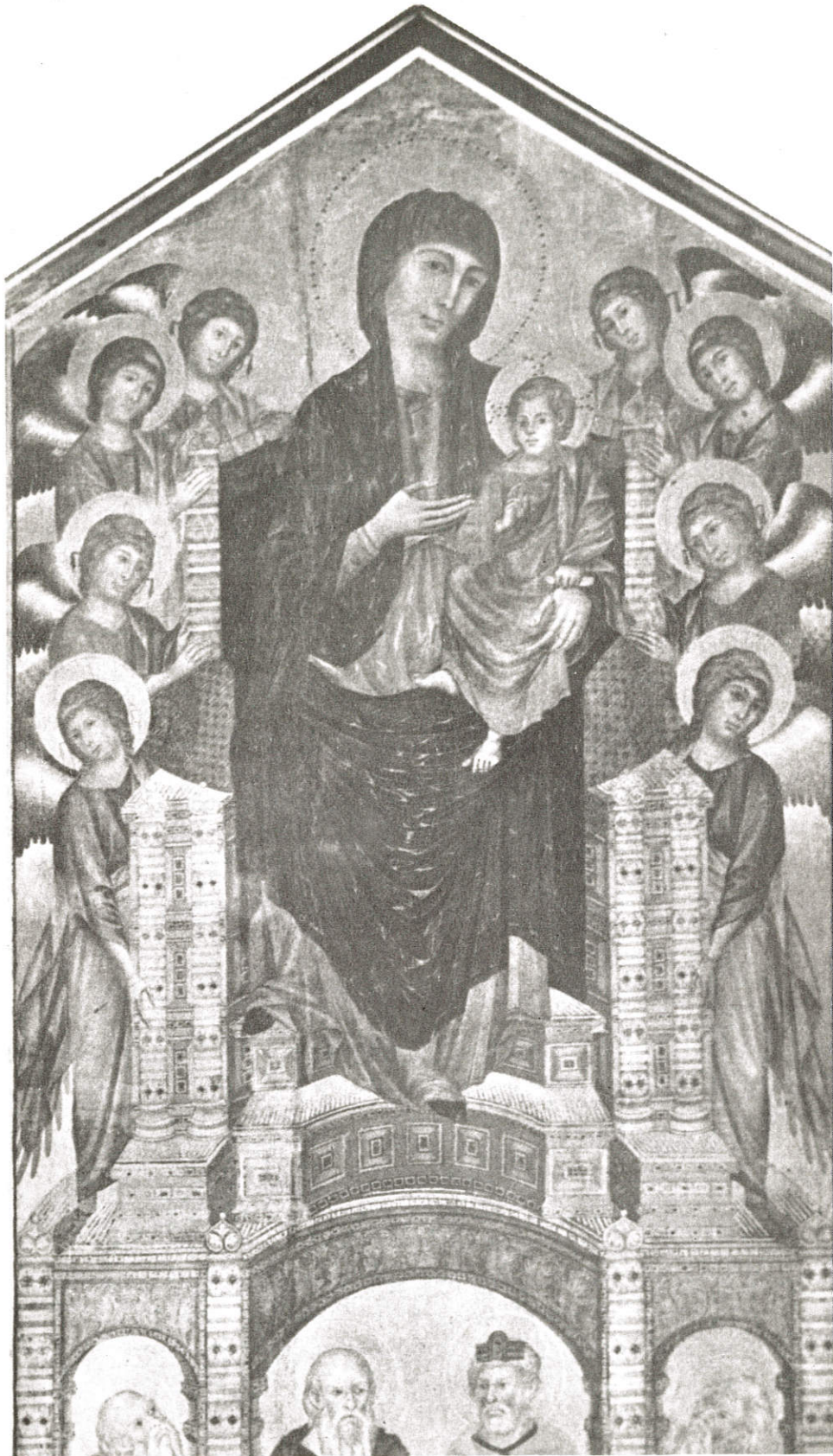
CIMABUE The Virgin and Child Enthroned