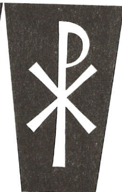
Chi Rho, the first two letters of Christ's name in Greek, a monogram implying triumph.